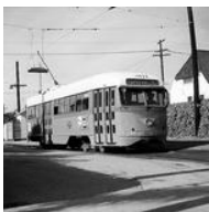
Larchmont Boulevard History: ...