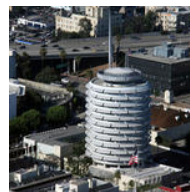
Millennium Hollywood Project Passes ...