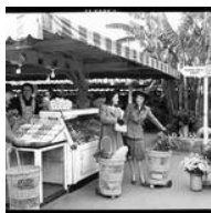
Looking Back to Mid Century Los Angeles