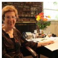
Larchmont Chronicle Celebrates Fifty ...