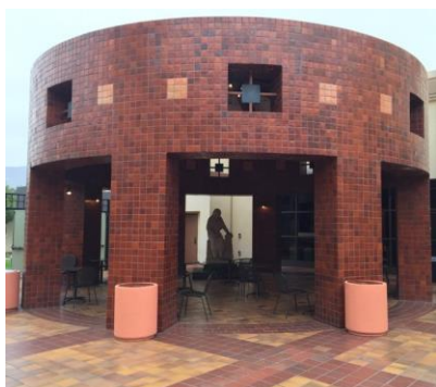
Autry Plaza Rotunda

California Yarnscape will have seven sections of four large rectangles. The Rotunda has eight sections. One of the sections is obscured by the adjacent cafe building. Up to 28 large rectangles and 21 small squares will be selected for the exhibition. The view obscured section will be created as an open participation, YBLA project.